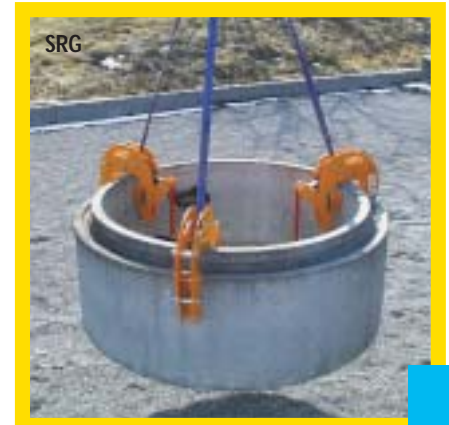
Easy handling caused by low dead weight.