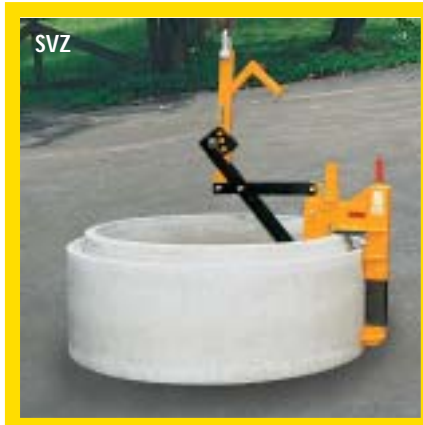
Rubber pads of the grippers avoid damage to the concrete elements.