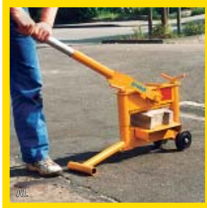
The inclined supporting table allows the cutting on an angle, so the irregular cut always fits.

Using the leverage of the adjustable excentrical lever, slabs and pavers can be split precisely and quickly. Different versions are available dependant on cutting length and cutting height. They come with a square blade, which is turned on its edge, giving you a total of 4 sharp cutting edges. The types AL 33/S and AL 43/S come with special segmental teeth, which allow you to cut clay bricks and natural stone.