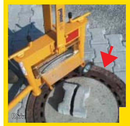
The RSA converts each standard block cutter into a radial cutter within seconds

The RSA converts each standard block cutter into a radial cutter within seconds. Now concrete pavers can be cut with a radius pattern, so allowing pavers to be placed around gullies quickly and accurately.