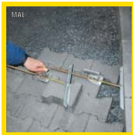
The measuring and marking tool MAL is a light-weight precision tool for measuring and marking the length and angle of a paver, which has to be cut. This easily folds away, and is an ideal paving accessory.

Result: a more professional finish and higher economics.